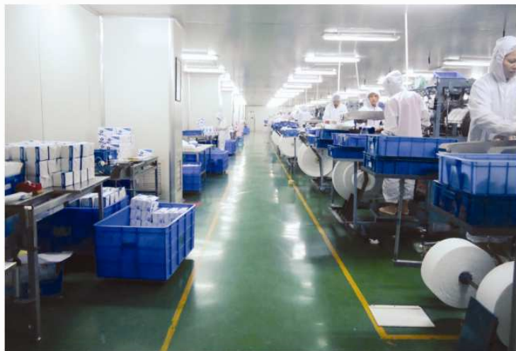
gauze swabs workshop