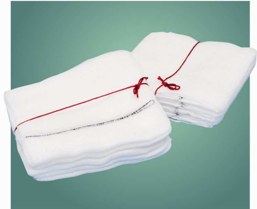
Gauze swabs with tie