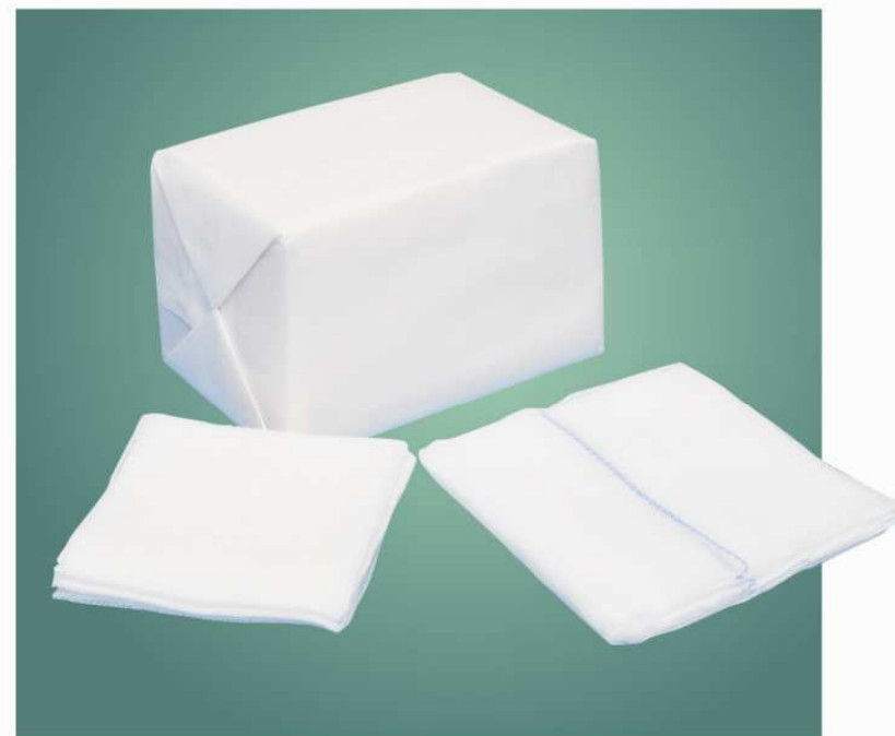
Non sterile gauze swabs (Bulk)

Comfortable, Latex- Free, With or without X-Ray