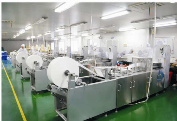
non woven swabs workshop