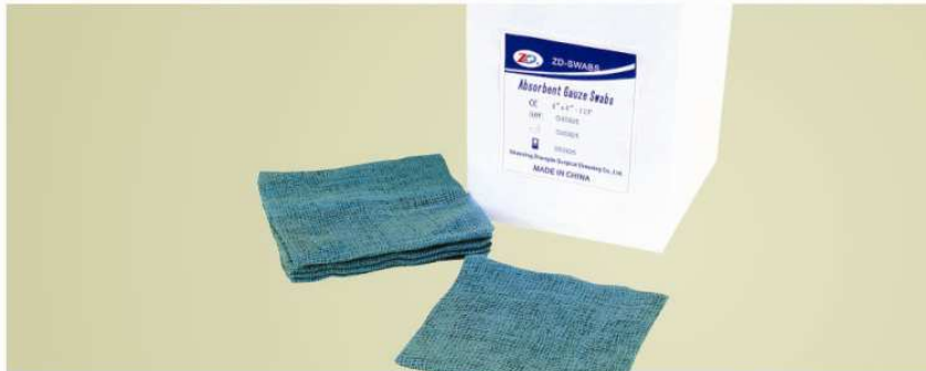
Gauze swabs with colors